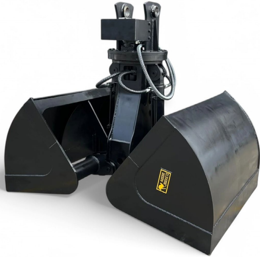
*Pictured model: 30-40 T Rotating Clamshell Bucket