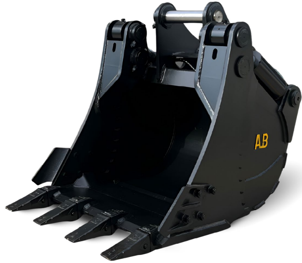
*Pictured model: 18-28T Heavy Duty 4-in-1 Bucket