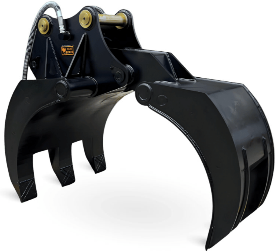
*Pictured model: 20-24T Hydraulic Grab