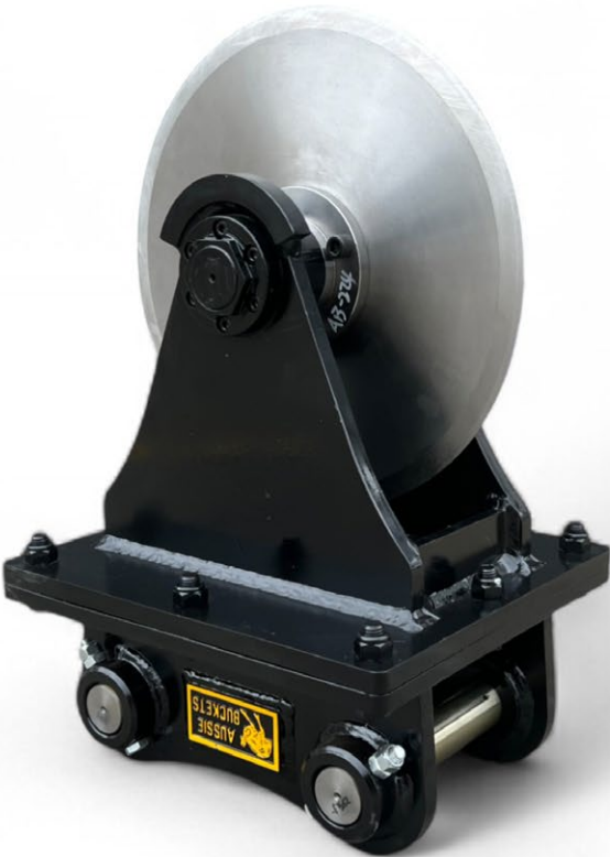
*Pictured model: 4.5-7T Asphalt Cutter