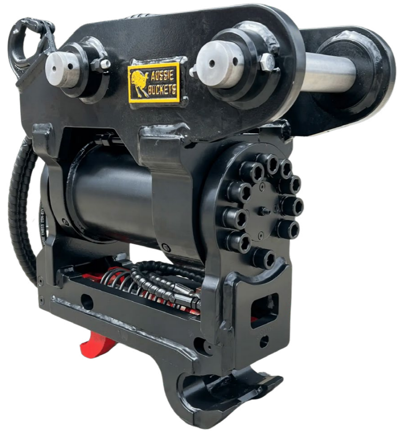
*Pictured model: 7-9.9T Hydraulic Tilting Hitch