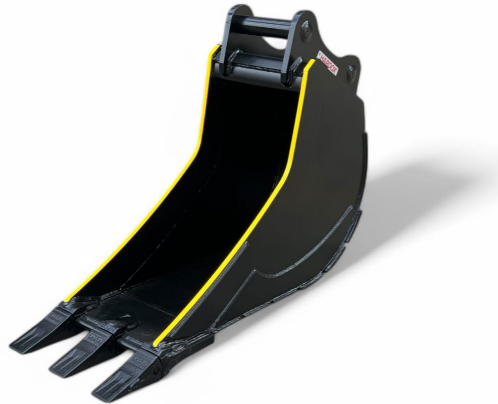
*Pictured model: 12-14 T Cable Bucket