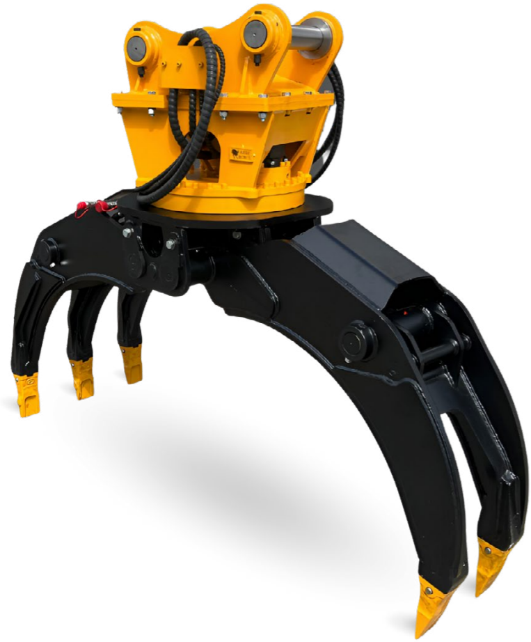
*Pictured model: 11-15T Rotating Multipurpose Grab